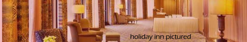
holiday inn pictured

visit seequincy.com for complete 3-county listing