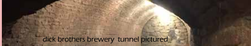
dick brothers brewery tunnel pictured