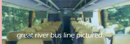
great river bus line pictured

WELLMAN FLORIST 1040 BROADWAY | 217.222.2030 wellmanflorist.com