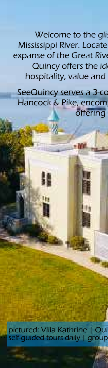
pictured: Villa Kathrine | Quincy's Tourist Info Center self-guided tours daily | group tours by appt | thevillakathrine.org

SeeQuincy serves a 3-county area consisting of Adams, Hancock & Pike, encompassing nearly 300,000 people, offering 1750+ hotel rooms collectively.