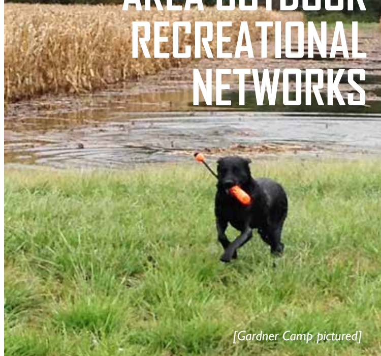
[Gardner Camp pictured]