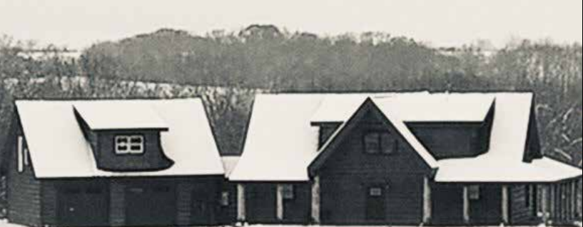
[Heritage Lodge is a full log 3750-sq-ft construction overlooking Bear Creek]