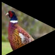
UPLAND/ SMALL GAME

PIKE COUNTY #1 in the state for deer quantity harvested each season #2 in the nation for the highest quantity of trophy whitetails, Pike's topography is ideal with its rolling hills, creek bottoms & river bluffs. The combination of hardwood woodlands & multi-culture agriculture provides the perfect blend of components for quality white tail deer, wild turkey, waterfowl, and a variety of other game species.