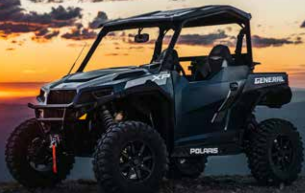
[Polaris Adventure Destination : Heartland Lodge]