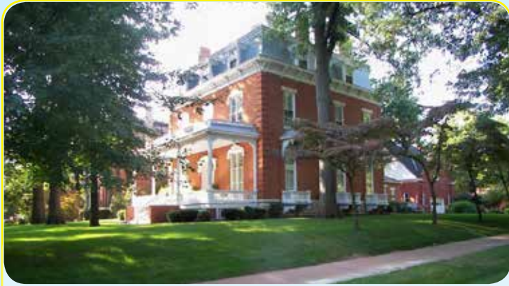
DAVID W. MILLER HOUSE / 1477 MAINE

Street parking is easy & free in this quiet residential neighborhood. You're welcome to park at The Quincy Museum (#3 below) ~it's a magnificent masterpiece we encourage you to tour.