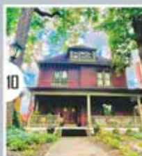
1233 PARK PL