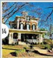
327 S 16TH