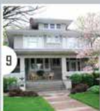
230 S 24TH