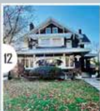
310 S 16TH