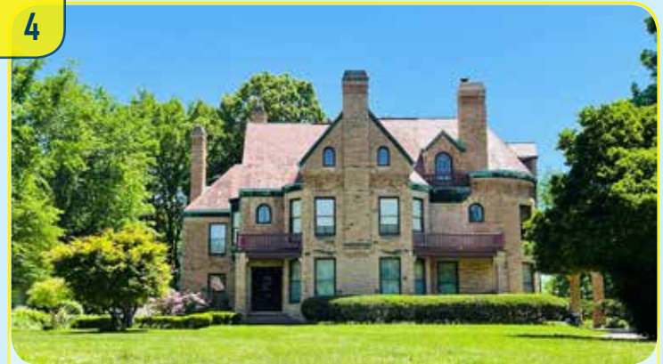
WILLIAM WARFIELD HOUSE / 1626 MAINE