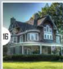
228 S 18TH