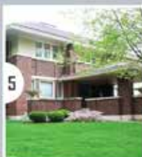
129 EAST AVE