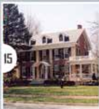
218 S 18TH