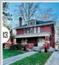
320 S 16TH