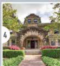
166 N 18TH