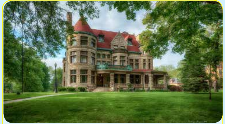
NEWCOMB-STILLWELL MANSION / 1601 MAINE

1866 / FRENCH SECOND EMPIRE / MANSARD ITALIANATE