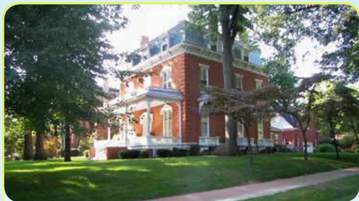
DAVID W. MILLER HOUSE / 1477 MAINE

Street parking is easy & free in this quiet residential neighborhood. You're welcome to park at The Quincy Museum (#3 below) ~it's a magnificent masterpiece we encourage you to tour.