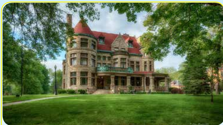
NEWCOMB-STILLWELL MANSION / 1601 MAINE

1866 / FRENCH SECOND EMPIRE / MANSARD ITALIANATE