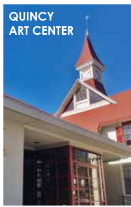
QUINCY ART CENTER