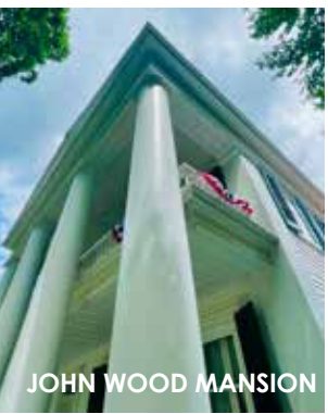
JOHN WOOD MANSION